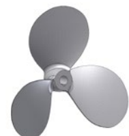
Plenty Forward Rake