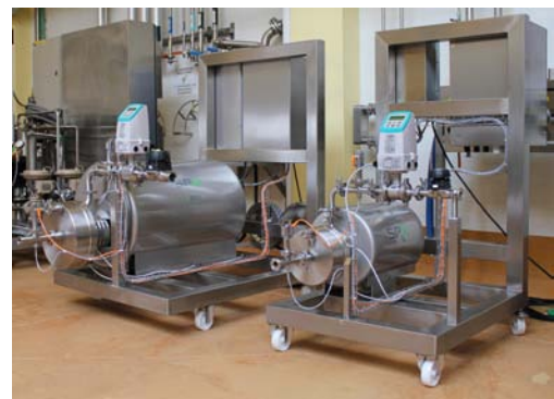
Fig. 1: APV Cavicator

The APV Cavicator™, shown in Fig. 1, has multiple applications (Table 1) in pre-treatment and conditioning of the yoghurt milk, smoothing of high protein yoghurt and fresh cheese types, hydration and functionalization of ingredients, scale free heating and aeration. The microstructural conditioning and functionalization it performs can unlock the natural functional properties from whey proteins that can improve yoghurt viscosity, texture, stability and taste in low or non-fat nutritional products.