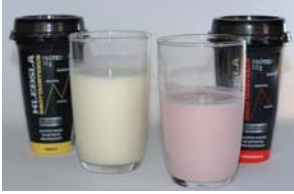
Fig. 2: High protein yoghurt sports drinks