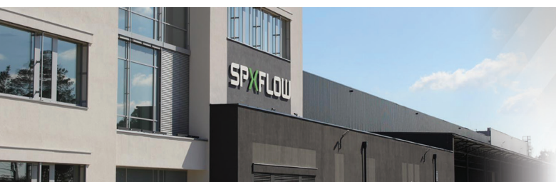
SPX FLOW BYDGOSZCZ, POLAND