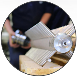
Modern, high quality manufacturing operations at the SPX FLOW facility in Bydgoszcz, Poland