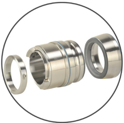
Original spare parts protect equipment efficiency and reliability