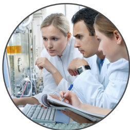
Expert training seminars