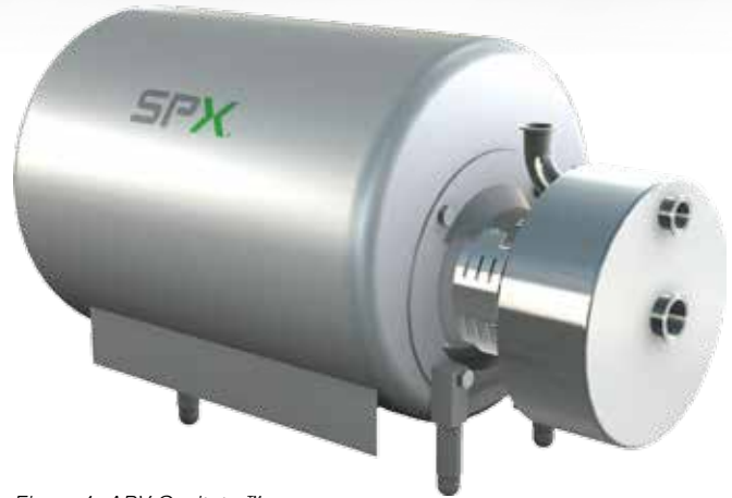
Figure 1: APV Cavitator™

There is an increasing demand from consumers for more nutritional products that are natural, functional, healthy, tasty and convenient products which is leading to expanding application requirements. Combined with highly competitive market places and environmental pressures, new and innovative processing technologies are needed.