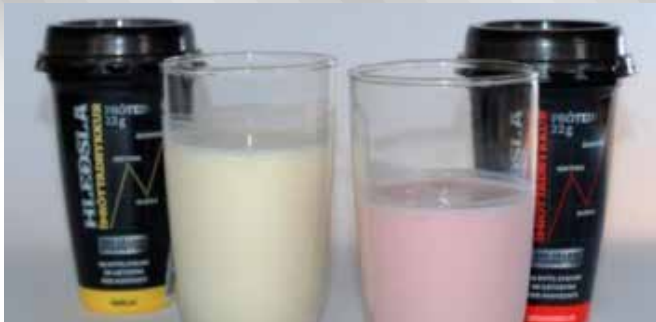
Figure 2: High protein yoghurt sports drinks

Compared to the Lean Cream System the multi-purpose CaviMaster™ technology enables higher denaturation temperature and very long run time without fouling. It produces very narrow particle sizes of 1-1,5 micron (Fig.3) ideal for many products.