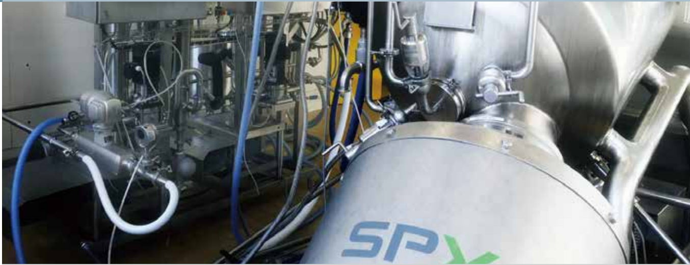
Spreadable Cheese Pilot Plant, SPX FLOW Innovation Center, France