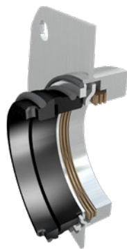
Single Mechanical Seal