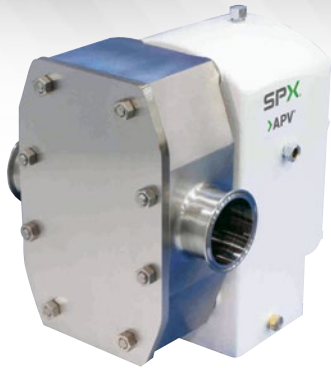
MADE IN USA