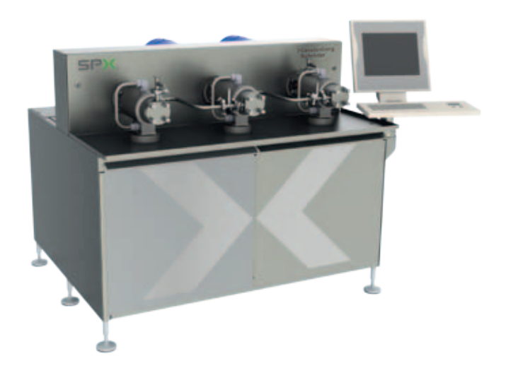
GS Nexus pilot plant for fat crystallization. The GS Nexus uses \mathrm{CO}_{\rm 2} as cooling medium.

Various methods for analysis of the microstructure of spreads exist. These are useful tools when establishing the relation between composition, processing and final properties. Functional properties such as firmness, spreadability, mouthfeel, emulsion stability and flavour release are all linked to the product microstructure. At the SPX Innovation Center close to Copenhagen, Denmark, we have facilities for pilot plant trials as well as a broad range of new equipment for measurement of product quality, and we can therefore offer our customers assistance with the development of high quality products.