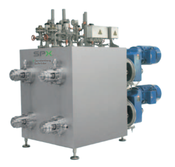
SSHE units from the GS brand: GS Nexus and GS Consistator® MD

It is mainly crystallization in the continuous phase that seems to influence the consistency of the blended spread. This means that it is not necessarily the amount of crystallized fat at a given