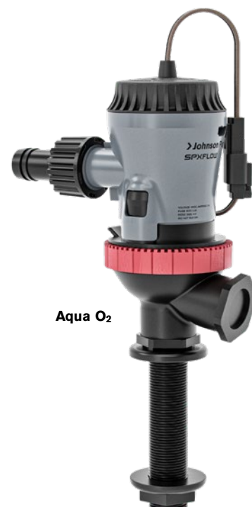
Aqua O 2