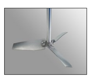
A510: General Purpose Impeller

Lightnin product can be built and certified to meet the requirements of CE, ATEX, PED, GOST, RTN (including technical passports), NORSOK, VIK and DNV DRILL(N), as well as other certifications that might be required.