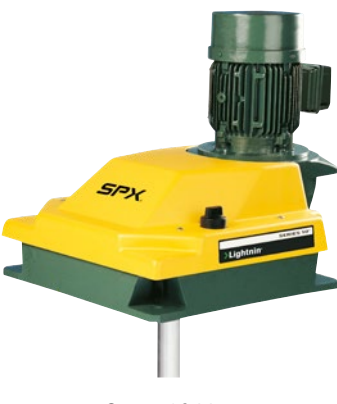
Series 10 Mixer