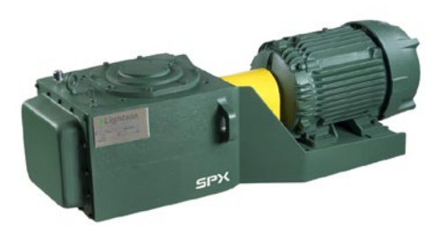
Right Angle Drive Mixer