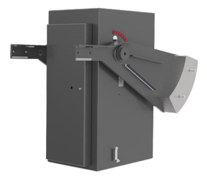
Barrier cabinet internal assembly