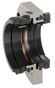
Double Mechanical Seal

Abbreviation Key: SM Single Mechanical DM Double Mechanical C Carbon SC Silicon Carbide TC Tungsten Carbide NF Narrow Face Inner = Product Side, Outer = Flush Side