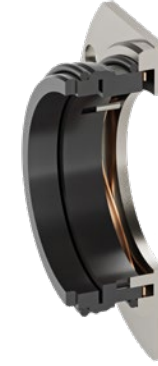
Single Mechanical Seal