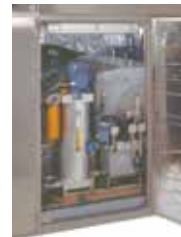
Oil and Hydraulic Units