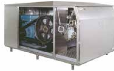
Transmission (Power End)

We will be happy to discuss any other requirements you may have.