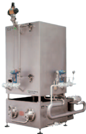
GS Kombinator 250 SHCW for high pressure pasteurization.

The pasteurization process has several advantages. It ensures inhibition of bacterial growth and growth of other micro-organisms and thus improves the microbiological stability of the emulsion. Pasteurization of only the water phase is a possibility, but pasteurization of the complete emulsion is preferred since the pasteurization process of the emulsion will minimise the residence time from pasteurized product to filling or packing of final product. Also, the product is treated in an in-line process from pasteurization to filling or packing of the final product and pasteurization of any rework material is ensured when the complete emulsion is pasteurized.