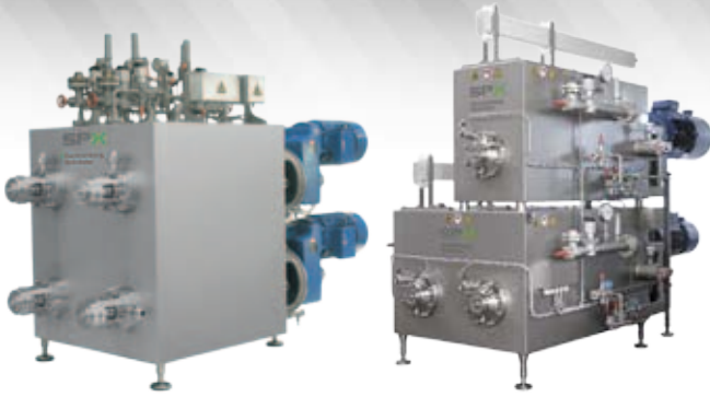
SSHE units from the GS brand: GS Nexus and GS Kombinator.

and kneaded simultaneously. When the fat in the emulsion crystallizes, the fat crystals form a three-dimensional network entrapping the water droplets and the liquid oil, resulting in products with properties of plastic semi-solid nature.