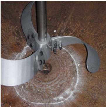
KT-3 kicker to the left, no product left in tank.