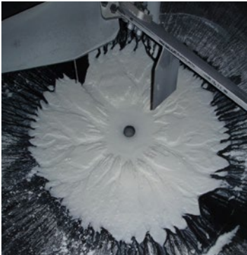
A310 kicker to the left, product still visible in tank.

In one case, a solids heel was reduced 98.9% by adding the KT-3. The KT-3 is patented by Dow Chemical and licensed for sale exclusively by Lightnin.