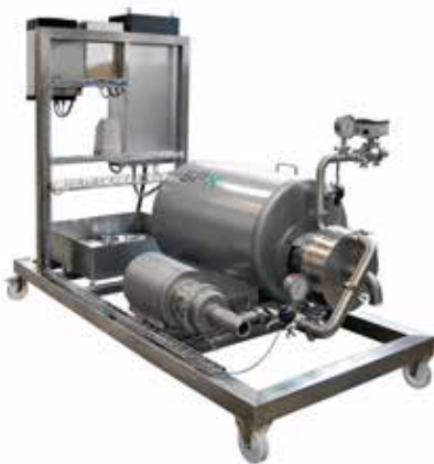
APV Cavimator Pilot Plant for customer rental

THE APV CAVITATOR CAN BE USED FOR A WIDE RANGE OF APPLICATIONS AND PRODUCTS ACROSS THE FOOD AND BEVERAGE MARKETS.