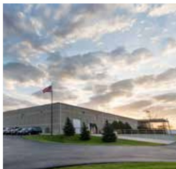
SPX FLOW innovation and pilot plant service center Silkeborg Denmark