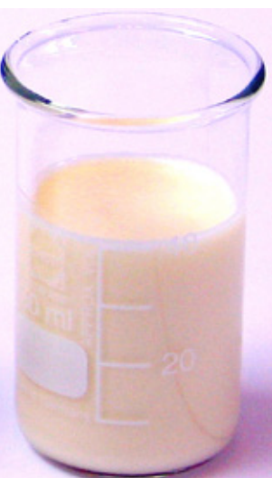
WPC60 WPC60-FI before functionalisation after functionalisation Controlled cavitation is instrumental for new functional properties in healthy food