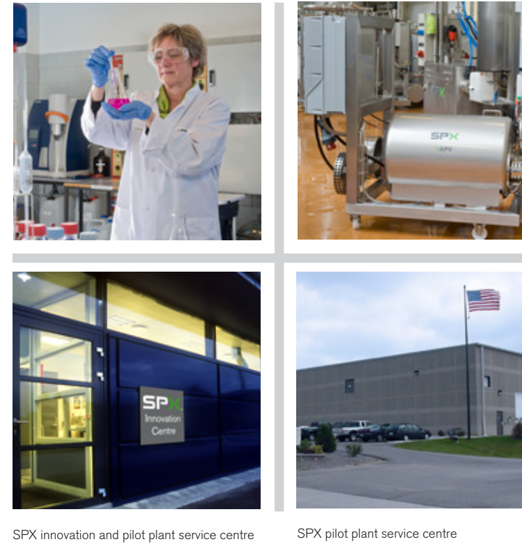
lant service centre SPA Delav USA