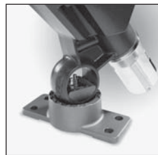
Cup Plate Assembled