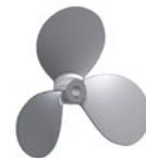
Plenty Forward Rake

TYPICAL PRODUCT APPLICATIONS: Vegetable Oil, Processors, Oil Bunkers and Biofuels Storage, Breweries, Alcohol Distilleries and Wineries, Sugar Refineries, Chemicals, Hydrocarbon, Production/Processing, Soft Drink Manufacturers, Water Treatment