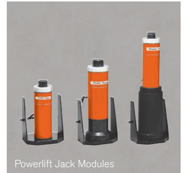
Powerlift Jack Modules